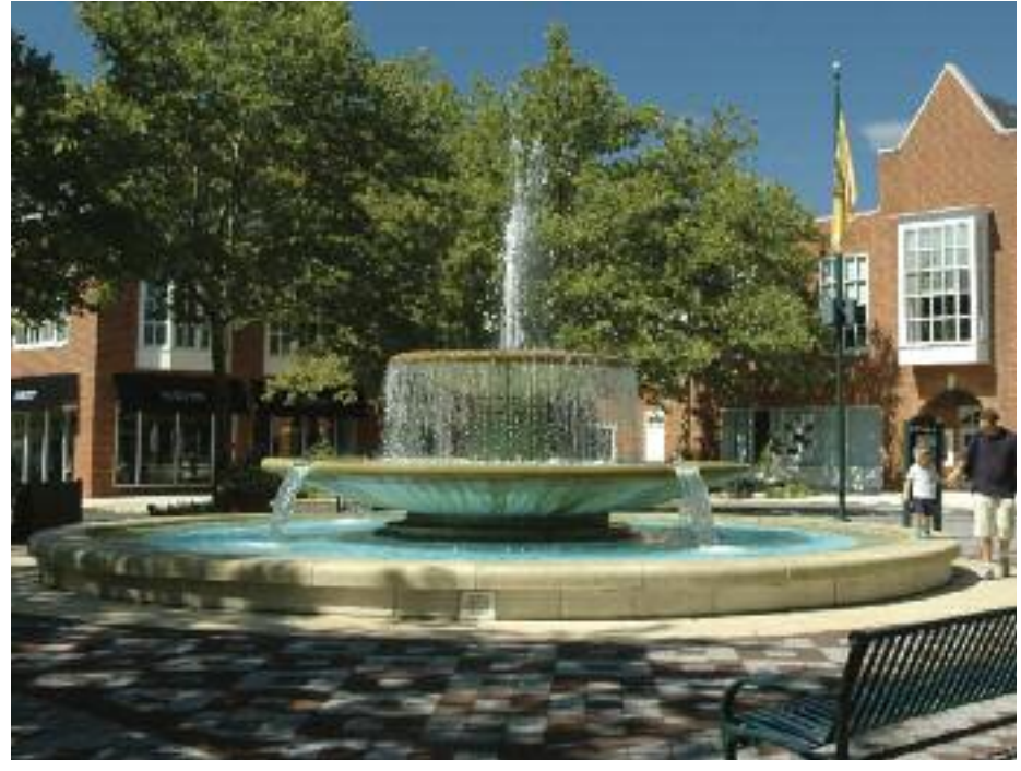
Princeton Forrestal Village

The 42-acre Princeton Forrestal Village development in Princeton, New Jersey, was built in 1987 and re-modeled in 2007 with improvements that have