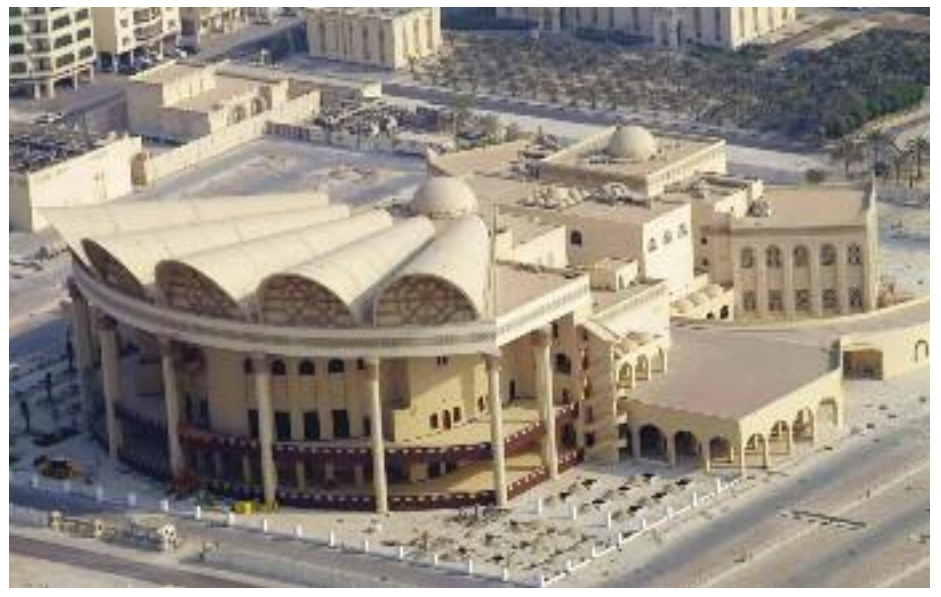
Bahrain's national library

The center hosts cultural and scientific activities, exhibitions, conferences and forums, one of its functions being to promote dialog between cultures and